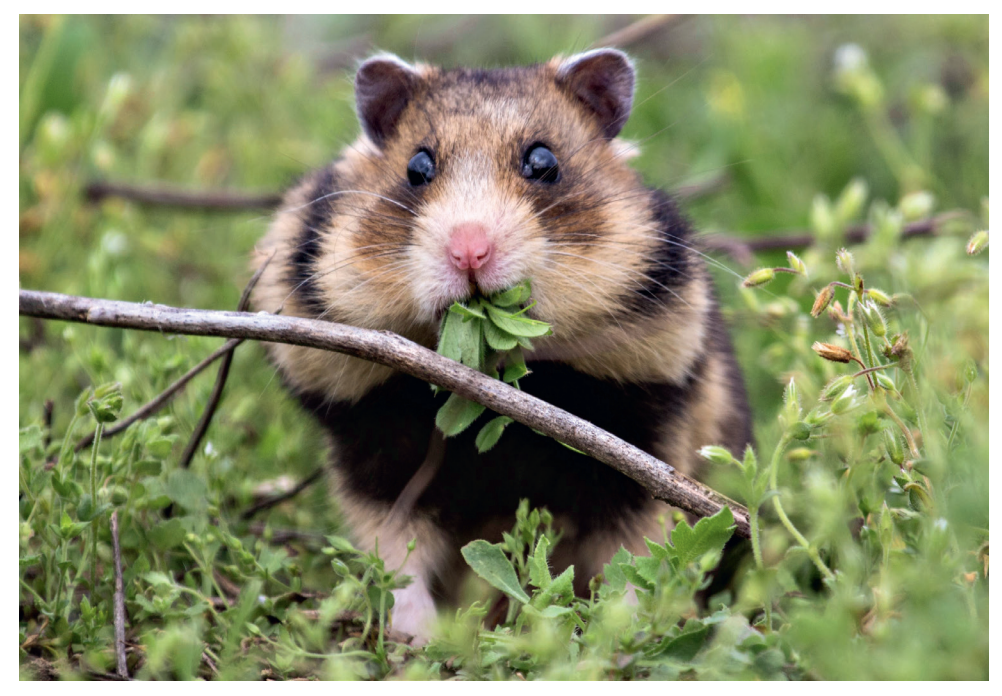
Figure 7. Romanian hamster feeding on Medicago minima (Fabaceae).