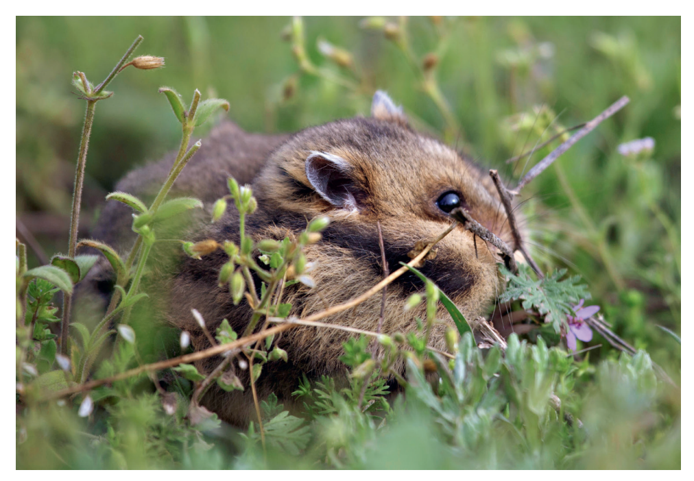
Figure 4. Romanian hamster feeding on Erodium cicutarium (Geraniaceae).