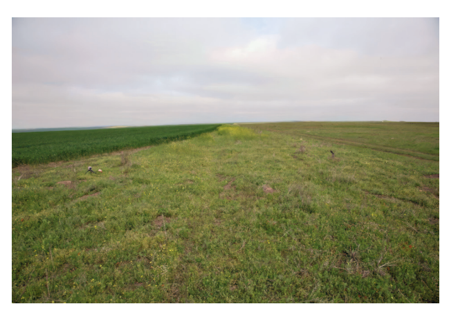
Figure 1. Habitat of the monitored M. newtoni , characterized by steppe pasture with ruderal vegetation, adjacent to wheat crop fields.