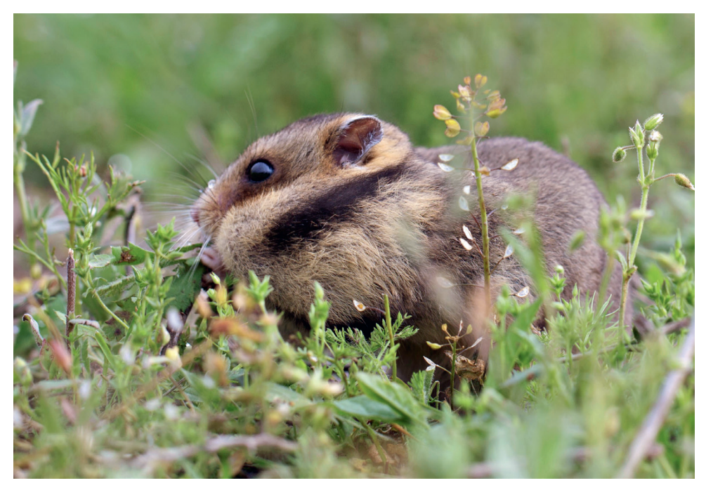
Figure 5. Romanian hamster feeding on Papaver rhoeas (Papaveraceae).