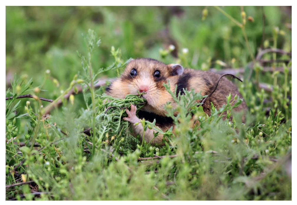
Figure 6. Romanian hamster feeding on Descurainia sophia (Brassicaceae).