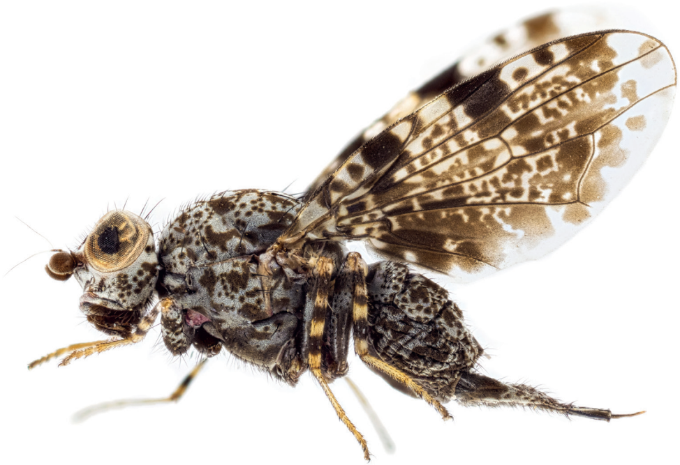
Figure 1. Female of Callopistromyia annulipes , lateral view.

Its first occurrence in the Palearctic Region came from Southern Switzerland in 2007, when one female was found in a vineyard (Merz 2007). It was recorded in the same year from Germany (Merz and Van Gysegheem 2007) and in 2011 from Netherlands (Smith and Hamers 2011). After this, it is recorded from Italy (flies photographed and posted on Diptera.info website by Niolu P. in 2009 and by Galliani C. in 2010), France (from a picture posted on Diptera.info website, in 2011), Slovenia (from an observation uploaded by Weites M. on Observation.org database, in 2011), Austria and Slovakia (female specimens collected in 2014 with beer traps) (Korneyev et al. 2014). In 2016, the species was found in Hungary (Kameneva and Pekarsky 2016) and in 2017 in Belgium (Ravoet and Farinelle 2017) and Czech Republic (Dvořák 2017). The last published records of the species in a new country in Europe are from Poland (Klasa and Jałoszyński 2018) and Ukraine (Dvořák et al. 2019).