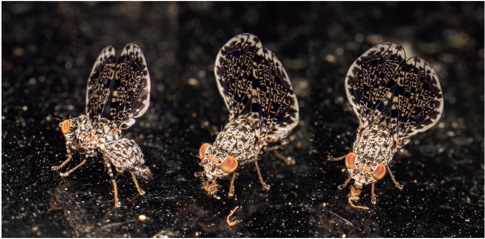
Figure 2. Female of Callopietromyia annulipes , in situ, showing its peculiar wings displaying.