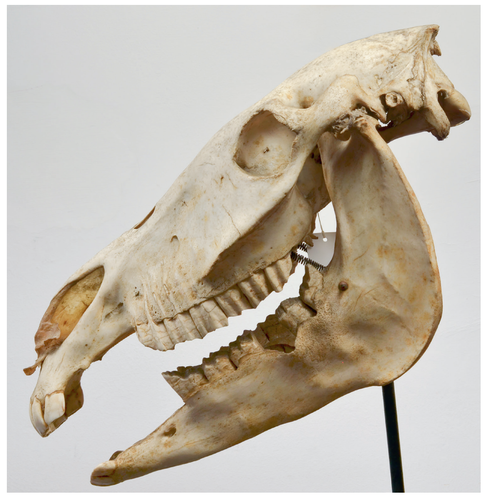
Figure 1. Biometrical characters used in the comparison of different equid species and breeds. See table 1 for identification of morphological features.