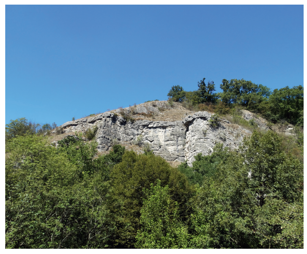
Figure 3. Aspect of the biotope, with pubescent oak on the slopes, characteristic for Kisanthobia ariasi.

Verdugo (2010) includes Romania in the distribution of this species, citing Kubáň (2006). After examination of this publication, Romania is not mentioned in this version of the catalogue, so we consider it was erroneously cited. Obregón (2012) also includes Romania among the countries where this species is present, mentioning Kubáň (2006) as source<sup>1</sup>.