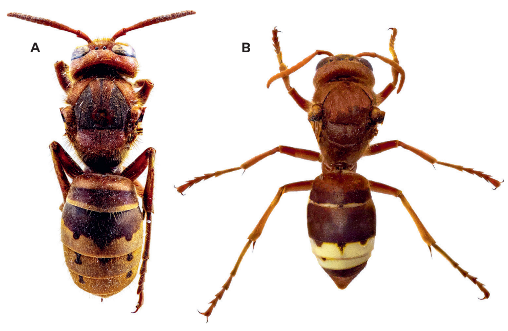
Figure 2. Body representation of the colour and pattern for Vespa crabro (A) and V. orientalis (B) (the wings were removed for a better visualization of the bodies).

in other European regions (The Iberian Peninsula, Northern Italy, Bulgaria, Southern Romania<sup>1</sup>, Ukraine, Kazakhstan and Germany) (Hernández et al. 2013; Temreshev 2018; Bressi et al. 2019) (Fig. 3).