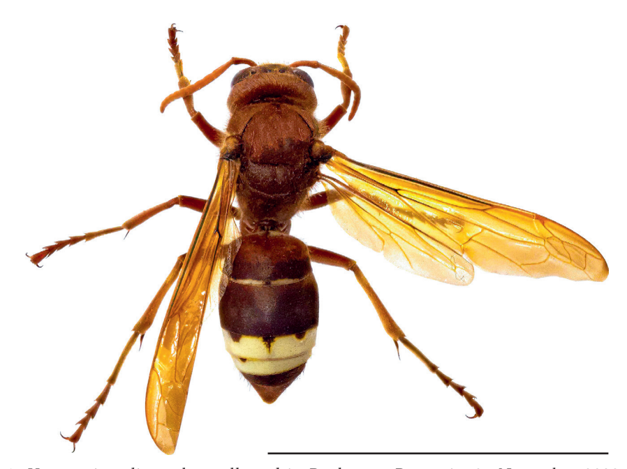
Figure 1. Vespa orientalis worker collected in Bucharest, Romania, 25 November 2020. Scale bar = 23 mm.