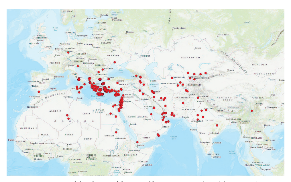
Figure 3. Actual distribution of the oriental hornet in Eurasia (GBIF) (GBIF, 2021).

As usual for many alien species during the spreading into new territories, they firstly colonise the human inhabited areas (towns, villages) (Early et al. 2016). It is premature to assume if it can spread into the natural or quasi-natural areas. If it remains mainly in the urban or semiurban areas, the threat for the autochthonous species (including honey bee) is expected to be low. The risks for humans to get stung can be increased to some extent, since hornets defend their nests ferociously if provoked.