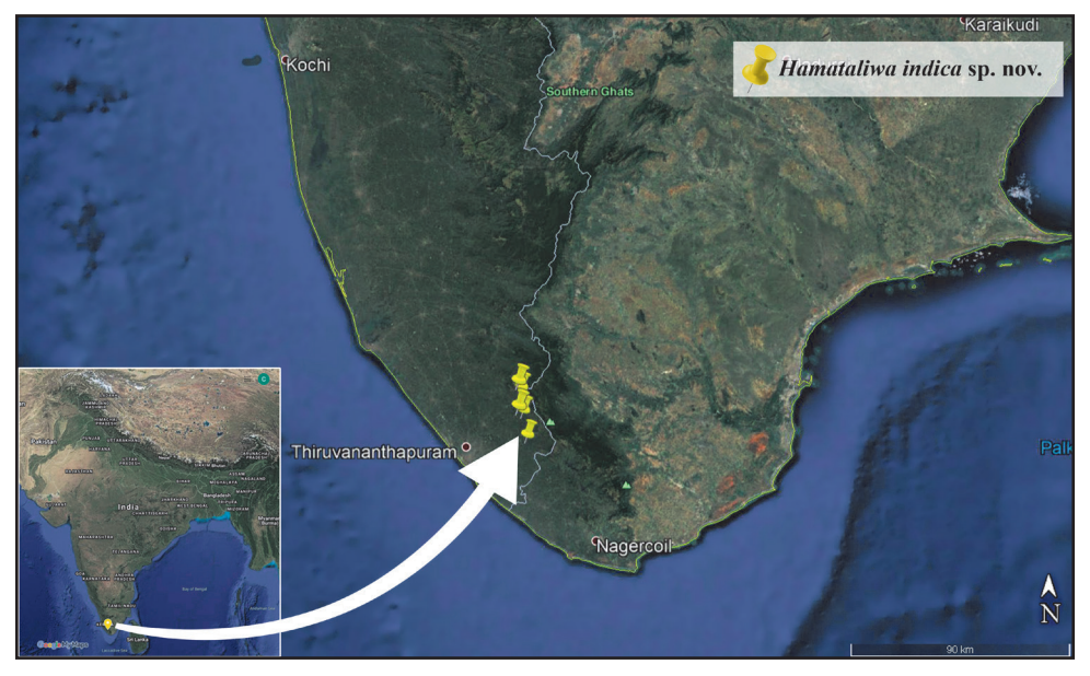
Figure 3. Type localities of Hamataliwa indica sp. nov. © Google.

brown, promargin with two unequal teeth and retromargin with a tooth, fangs brown. Labium (Fig. 1B) yellow-brown, longer than wide, anterior margin concave; maxillae yellow-brown, longer than wide, medially incurved. Sternum yellow, nearly cordate, anterior margin straight, posteriorly narrowed and pointed. Legs yellowish-brown, with numerous spines; leg measurements: I 9.68 (3.20, 3.71, 1.83, 0.95); II 8.84 (2.85, 3.10, 1.67, 1.22); III 7.32 (1.98, 2.86, 1.75, 0.73); IV 6.95 (1.85, 2.73, 1.65, 0.72); leg