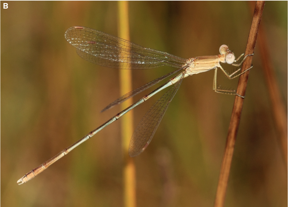
Figure 1. Males of dark (A) and pale (B) phenotypes of Lestes concinnus observed at Thalaimannar and Kavutharimunai.