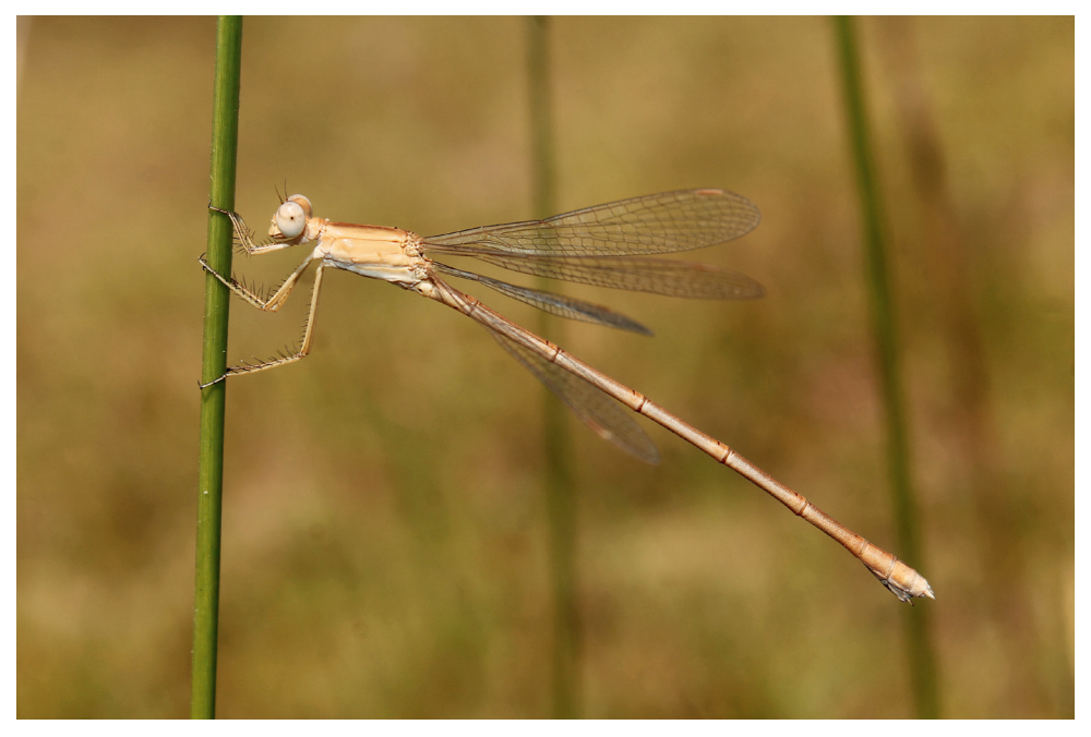
Figure 2. A female Lestes concinnus observed at Mannar Island.

Lestes concinnus can be differentiated from all other Lestes species in Sri Lanka by having a pale brown or olive green thorax with darker, often diffused, stripes along either side of the dorsal carina. No metallic markings on the thorax. The last abdominal segments usually have a thin black line along the mid-dorsal carina in most specimens and the cerci of the males are pale with dark apices. Eyes are pale