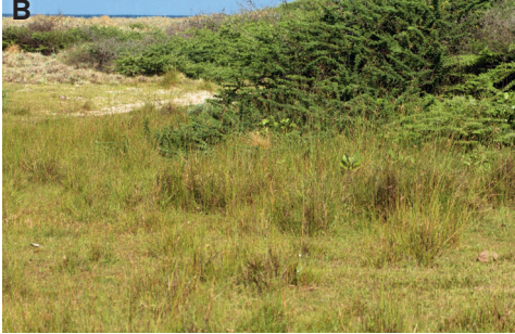
Figure 4. Habitat of Lestes concinnus in Kavutharimunai. A: expansive dry grasslands. B: dense reed patches with scattered scrub.