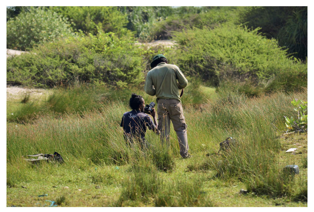
Figure 5. Habitat of Lestes concinnus in Talaimannar and the authors documenting the first known observation of the species in Sri Lanka.