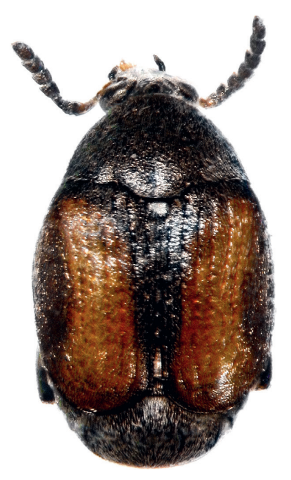
Figure 1. Habitus of Stator limbatus (Horn, 1873), male, dorsal view.

Maps were created using QGIS Version 3.18.2 free and open source Geographic Information System (https://qgis.org/en/site/).